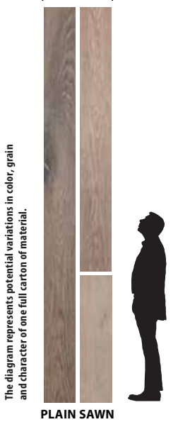
The diagram represents potential variations in color, grain ENGTH DESCRIPTION (23"-10") and character of one full carton of material.