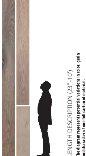
The diagram represents potential variations in color, grain and character of one full carton of material.