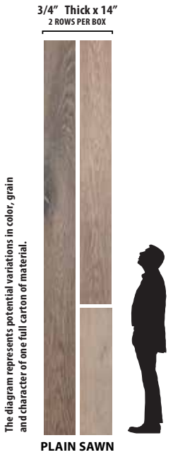
The diagram represents potential variations in color, grain ENGTH DESCRIPTION (23"-10") and character of one full carton of material.