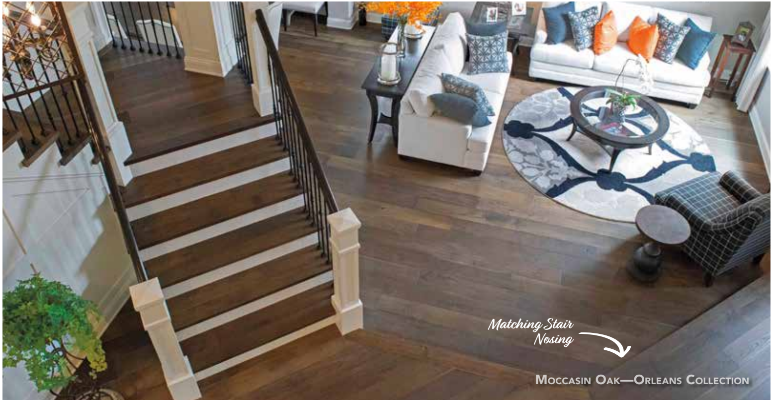
MOCCASIN OAK—ORLEANS COLLECTION