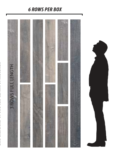
LENGTH DESCRIPTION (23" – 71") The diagram represents potential variations in color, grain and character of one full carton of material.

longest average length plank in the industry. In each carton of Artistry Hardwood flooring, at least 50% of the square footage will be represented as full-length planks. Most other products in the industry will use the language "up to" but never specify how many of the long planks are provided in each carton. Longer planks provide greater visual continuity to your space and show the true unique beauty of mother nature.