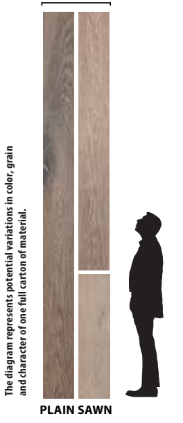
The diagram represents potential variations in color, grain ENGTH DESCRIPTION (23"-10") and character of one full carton of material.