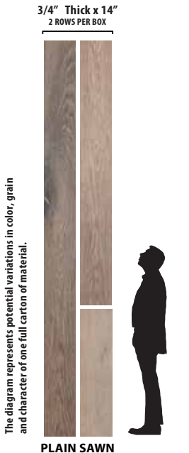
The diagram represents potential variations in color, grain ENGTH DESCRIPTION (23"-10") and character of one full carton of material.