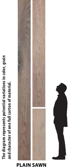
LENGTH\ DESCRIPTION\ (23''-10') The diagram represents potential variations in color, grain and character of one full carton of material.