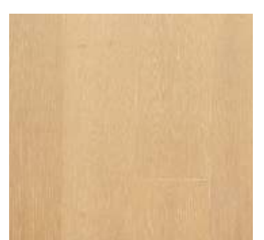
Cota Oak 50253