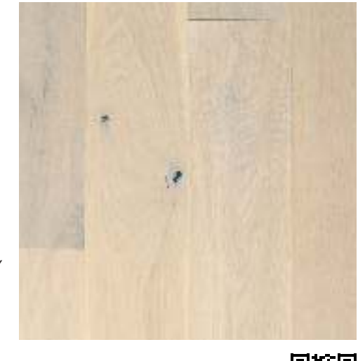
Acadia Oak 50252