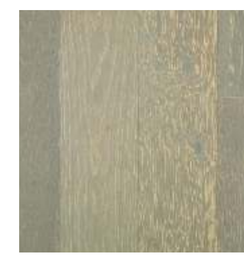
San Miguel Oak 50169